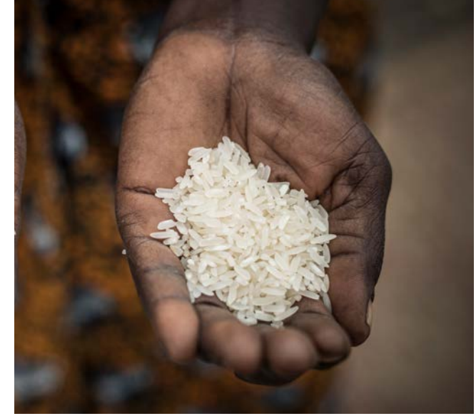
Because there is no longer enough money for basic foodstuffs, the portions are getting smaller.